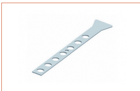
Anchoring flat bar